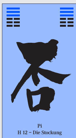
Hex 12 - Congestion Fatal Tumors