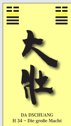
Hex 34 - Great Strength Immune system Allergy