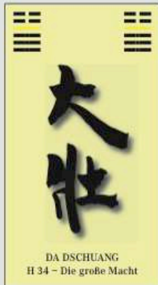
Fig. 1 Examples of Hexagram calligraphic Chinese symbols

Hex 34 - Great Strength Immune system Allergy